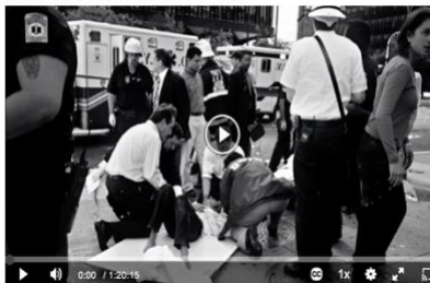
Man in Red Bandana Full Video (01:20:16)

Go to the link to see titles of interest. Please contact the library if you need any help with searching: https://fod.infobase.com/p_ViewVideo.aspx?xtid=210548&tScript=0