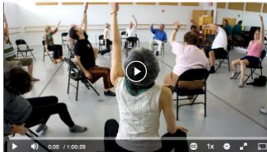
Capturing Grace Full Video (01:00:29)