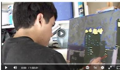
Generation A: Autism and the Arts Full Video (01:02:21)

It seems like two separate realms. One is occupied by acclaimed dancers from Brooklyn's Mark Morris Dance Group, the other by people with Parkinson's disease. This documentary is about what happens when those two worlds intersect. It is filmed over the course of a year and reveals the hopes, fears and triumphs of this newly formed community as they work together to create a unique performance.